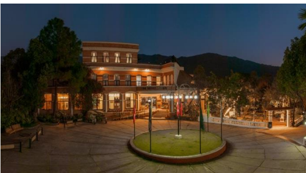
Park Village Votel, Kathmandu

Sauraha / Chitwan National Park: The village Sauraha is located in the subtropical Inner Terai lowlands of south-central Nepal close to the Rapti River. It is the eastern gateway to Chitwan National Park, the first national park in Nepal established in 1973 and granted the status of a UNESCO World Heritage Site in 1984. The National Park covers an area of 932 km 2 and hosts a famous biodiversity including the Bengal Tiger and the One-horned Rhino.