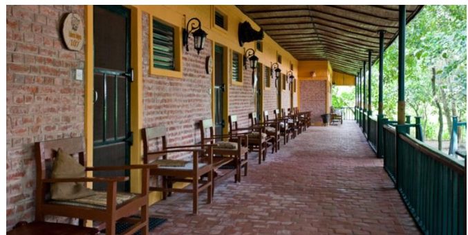
Maruni Sanctuary Lodge, Chitwan